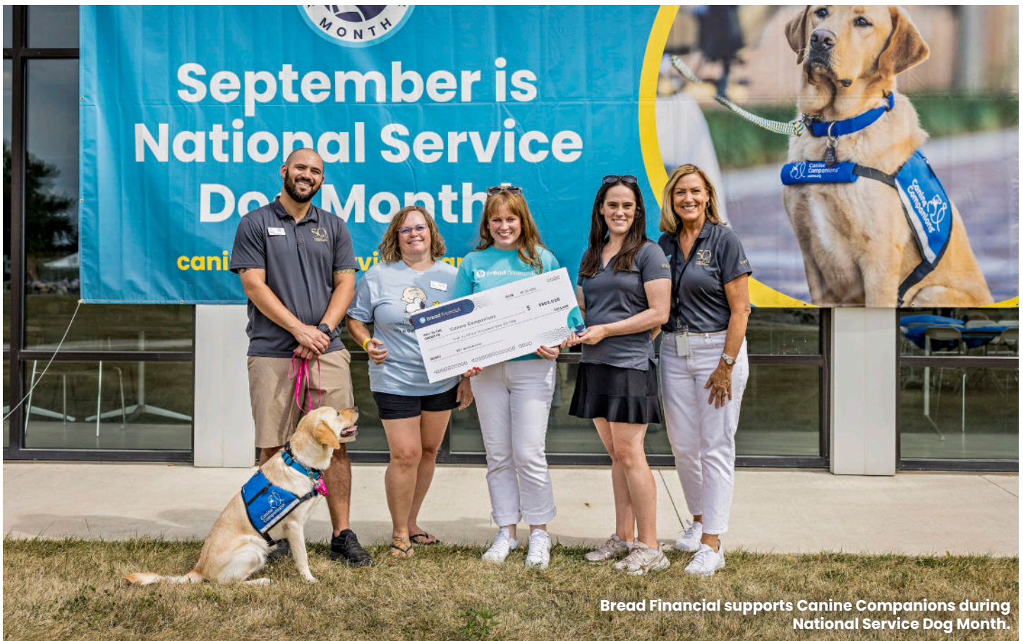
Bread Financial supports Canine Companions during National Service Dog Month.