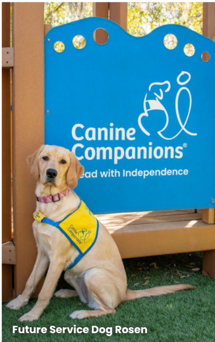
Future Service Dog Rosen