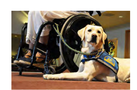
Service Dog Reba

For information on how to access grief resources, contact your client services or puppy program department.