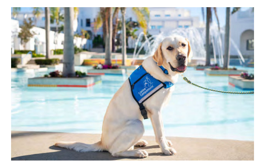
Facility Dog Brisket is helping people in crisis. Read more on page 10.